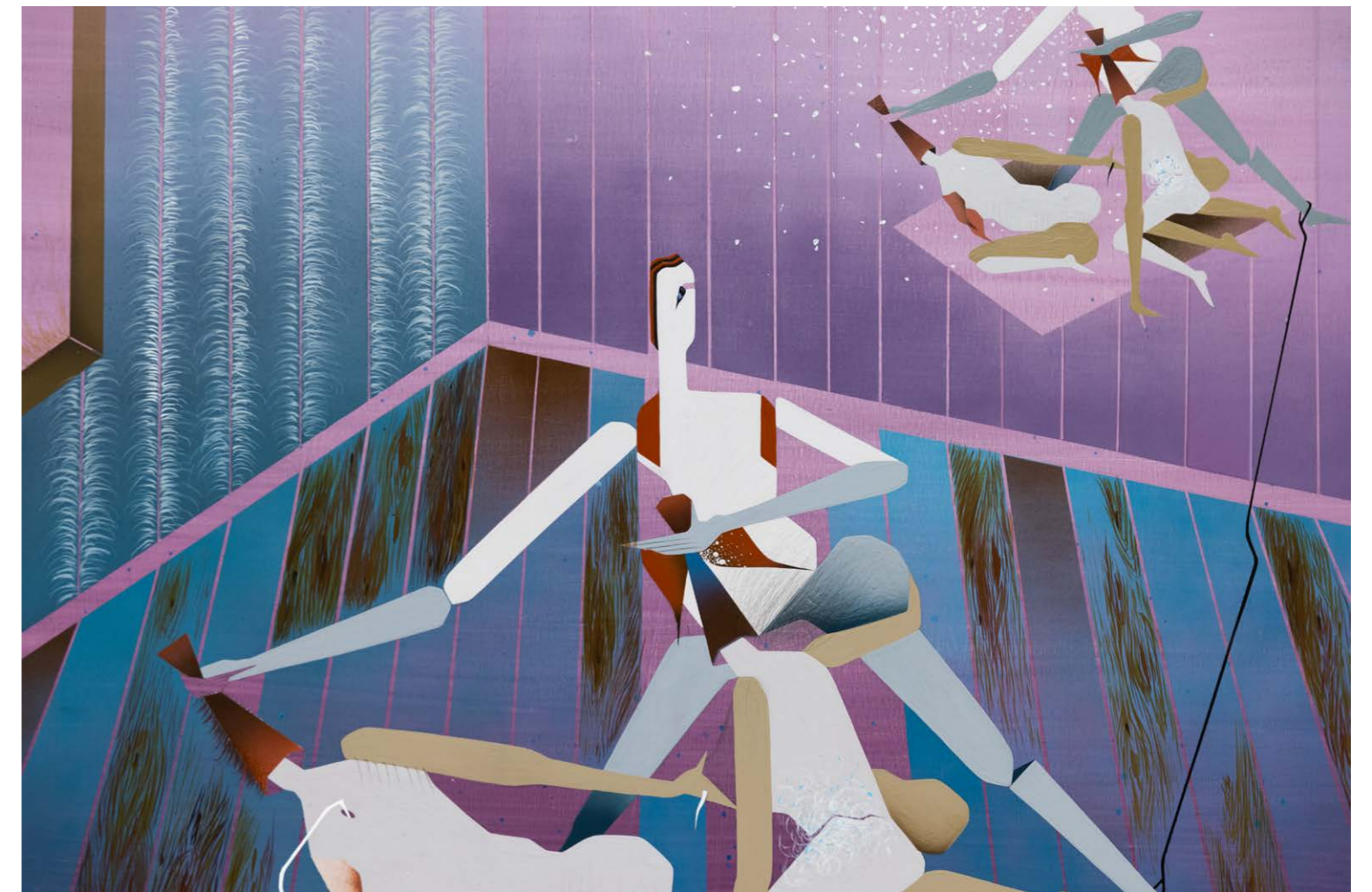
Below: Maryam Hoseini. Anxiously One on One . 2022. Detail. Acrylic, ink and pencil on wood panel. 101.6 x 76.2 cm.

a key theme in Hoseini's work and its exploration is central to her worlds, both internal and external.