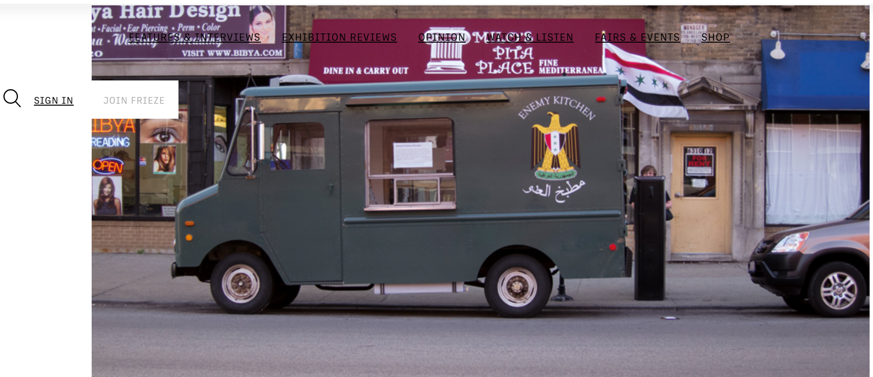
Michael Rakowitz, Enemy Kitchen , 2003-ongoing, documentation from 2012.

EM The circulation of date products or smuggled antiquities mirrors the migration narratives from Iraq and other war-torn countries in the Middle East. In piecing those narratives together with lost objects, you're sifting through all kinds of historical fragments – antiquities but also texts and documentation. In your project for documenta 13, What Dust Will Rise? [2012], you assembled disparate, cataclysmic objects: shards of the Bamiyan Buddhas, atomic minerals from the Manhattan Project, a brick from Pruitt-Igoe, granite from the World Trade Center. How did you make those selections?