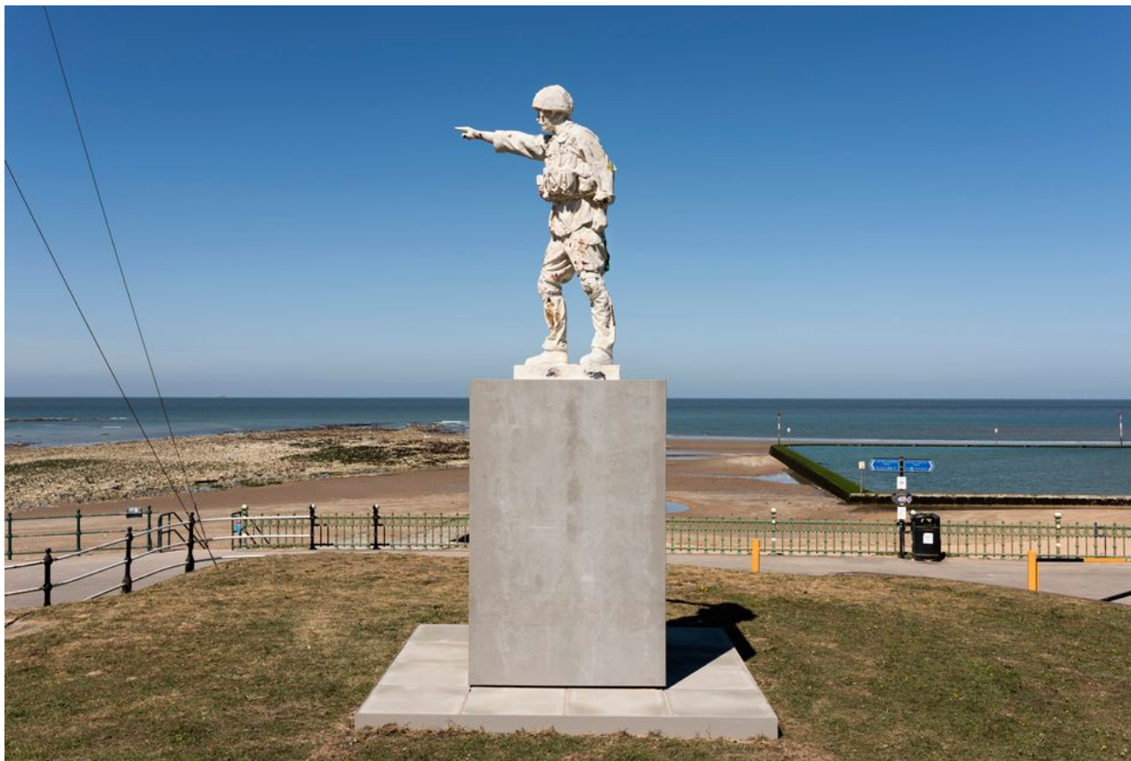
Michael Rakowitz's sculpture in Margate, April is the Cruellest Month (2021)

A brush with... series 4 runs from 9-30 June 2021, with episodes released on Wednesdays. You can download and subscribe to the podcast here . This episode is sponsored by Bloomberg Connects .