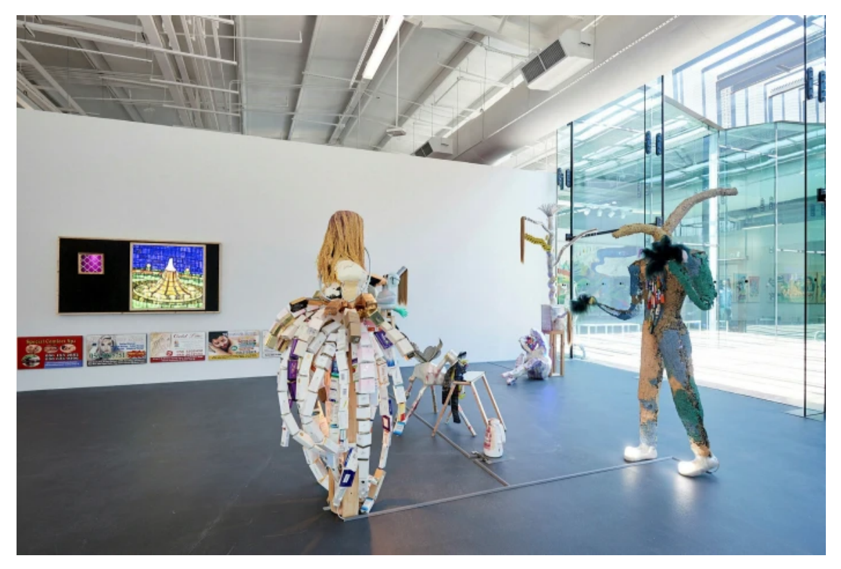
Hashel Al Lamki's exhibition, The Cup and the Saucer, at Warehouse 421 in Abu Dhabi, featured anthropomorphic assemblages

As local galleries pay more attention to young talent, they are picking up artists who are socially engaged, and inspired by changes in their environment.