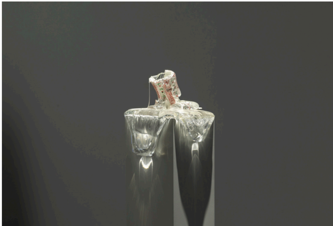
Preserving impatience I, 2017, Glass, porcelain, 20x20x10 cm