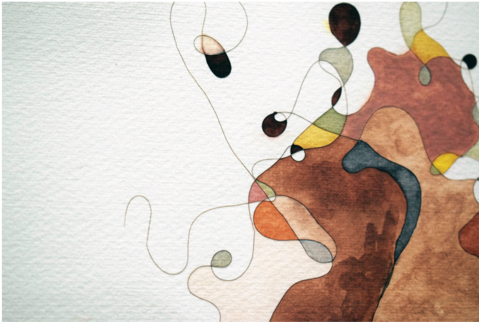
Hair Drawing 5 (detail), 2019, Hair and watercolor on paper, 26x36 cm, Green Art Gallery, Dubai