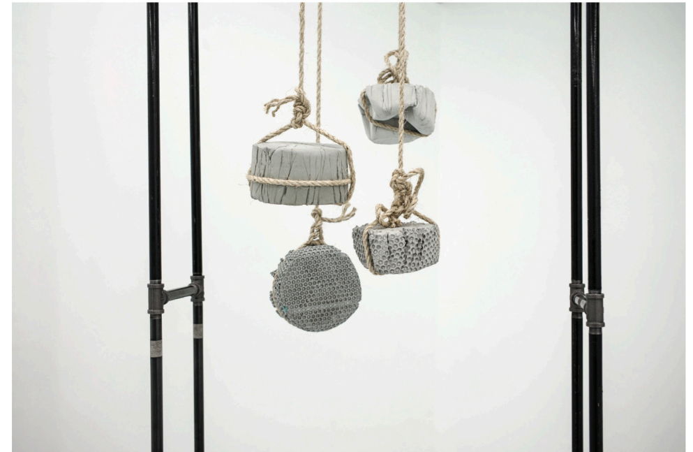
Who has time for It (detail), 2016, Steel pipes, rope, cement and plaster, 135x75 cm, Green Art Gallery, Dubai