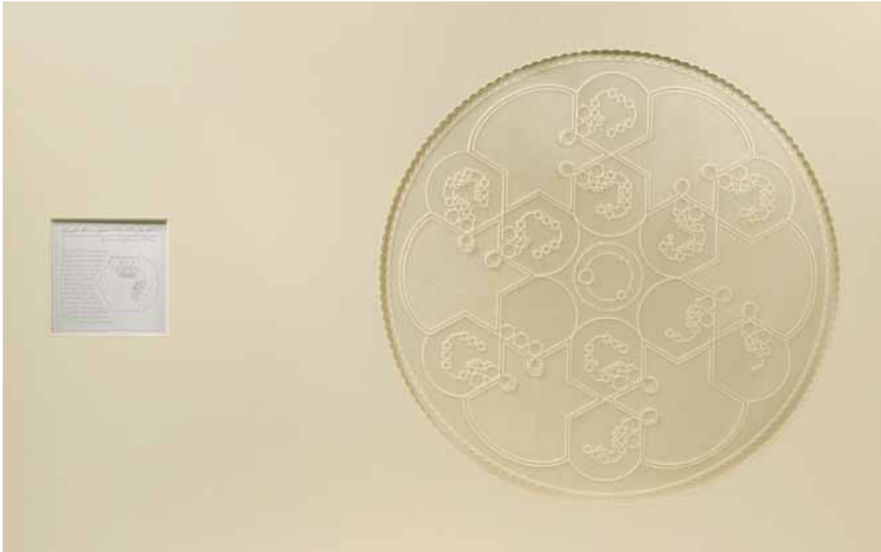
Non-flammable , Non-stick, Non-stain, 2010, Cast Silicon and Cardboard, 63 x 100 cm

Born in 1979, the Tehran-based artist graduated from the London College of Communication in 2001 before taking a Master in Fine Arts at the California College of the Arts (CCA) in San Francisco in 2003. A few years later, she took part in two artist residency programs, Cittadellarte Fondazione Pistoletto in Italy (2006) and Nordic Artists' Centre Dalsasen in Norway (2007), where she experienced distinctive approaches to artistic practice. While in Italy she was able to work in the context of multiple exchanges with other artists. The more individualistic approach of the Norwegian program enabled her to focus on her own projects and set the basis for her Patterns series, as she was reflecting on social and economic issues in a city like Tehran. Ansarinia's art has gained international recognition at an early stage of her career: a winner of the inaugural