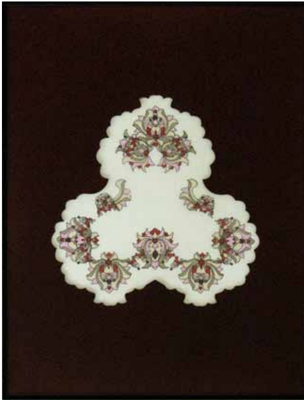
Patterns , 2009, Digital Drawings and Ink on Paper 43x32cm - Courtesy of Daniela Da Prato gallery.

of the intricacies and hidden relationships behind seemingly banal aspects of daily life. Her concepts and the works based on them are elaborations on the familiar and extensions of everyday reality. The starting point can be the occurrence of an event, the experiencing of a daily routine, or the noticing of an object or image; once she consciously looks for the re-occurrence of any of these particular events, her concepts gradually take physical form. Deconstructing the various elements, reordering them and finally reassembling them in a way that reveals something hidden, forgotten or even new about an already familiar subject, is the outcome of the processes she undertakes. Although these reconstructions sometimes include bringing together things usually not seen or associated together, they most often involve the rearrangement of elements taken from a single subject.