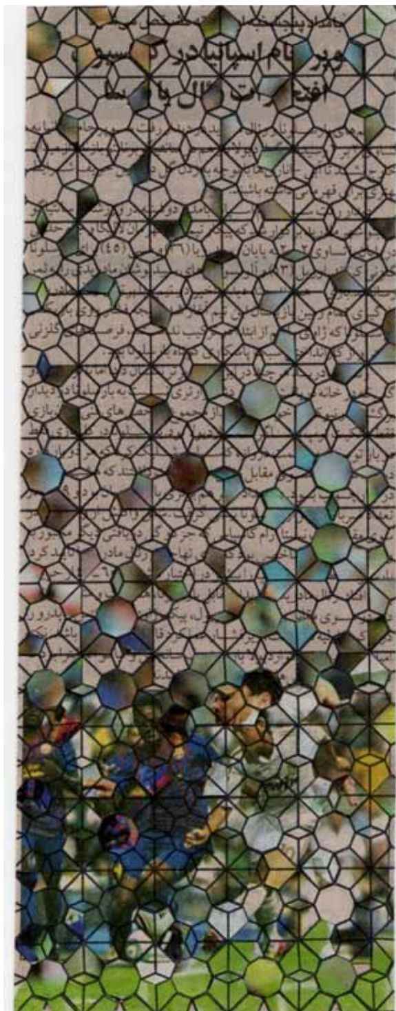
Reflections/Refractions , 2011 Spain's Super Cup to go in Real's or Barca's Collection of Victories/ The White Half of EL Clasico, 2011, Newspaper Collage, 19x7.5cm

circumstances. In Mendings 2010, she took a section from the middle of a chair, a carpet, a mirror and a mattress and re-attached the remaining two sections back together. While the mended objects maintained their symmetry and functionality, their new form and the seam where they had been attached created an inconvenience and an interruption in daily life.