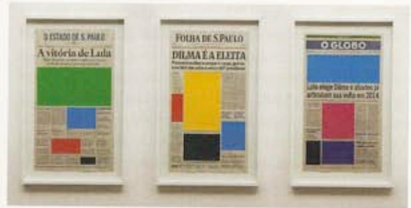
clockwise from lower left: two images from Alessandro Balteo Yasbeck, The Corrupted Files , 2012, © the artist, courtesy Galeria Luitza Strina, São Paulo; Adriano Costa, A Place Built to Be Destroyed , 2012, embroidery, 85 x 75 cm, photo: Ricardo Bassetti, courtesy Mendes Wood, São Paulo; Adriano Costa, Plantation , 2012 (installation view), photo: Ricardo Bassetti, courtesy Mendes Wood, São Paulo; Marlene Huginmair, Art for Modern Architecture Dilma's Election (detail), 2011, silkscreen on paper, 56 x 32 cm each, courtesy Luciana Brito Galeria, São Paulo