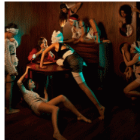
(Detail) The Hunger . 2011. C-print. 124 x 143 cm.