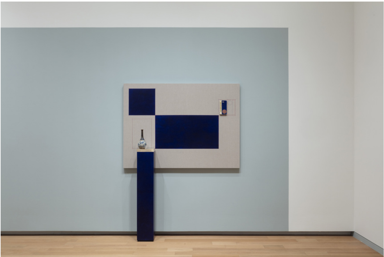
Installation view of KAMROOZ ARAM 's Blue Backdrop for Minor Arts , 2018, (panel) oil and pencil on linen; (pedestal) oil on mdf, brass, terrazzo; ceramic, (pedestal) 127.6 × 22.9 × 22.9 cm, (panel) 121.9 × 167.6 × 5.1 cm, at "Focus," Modern Art Museum of Fort Worth, 2018.