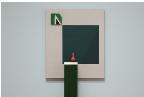
Installation view of KAMROOZ ARAM's Green Movement , 2018, (panel) oil and pencil on linen; (pedestal) wood, brass, terrazzo; ceramic, (pedestal) 127 × 22.9 × 22.9 cm, (panel) 127 × 106.7 × 5.1 cm, at "Focus," Modern Art Museum of Fort Worth, 2018.