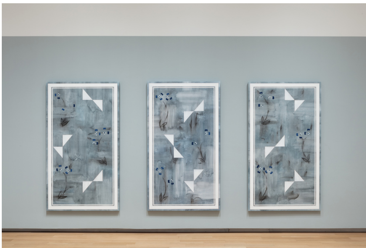
Installation view of KAMROOZ ARAM 's Ornament for Extraordinary Architecture , 2018, oil, wax, oil crayon and pencil on canvas, 426.7 × 198.1 × 4.1 cm, at "Focus," Modern Art Museum of Fort Worth, 2018.