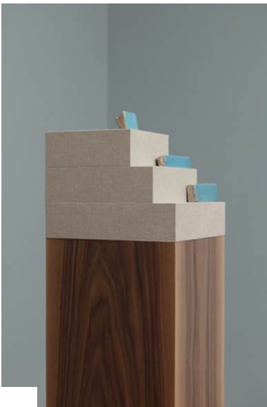
Installation view of KAMROOZ ARAM 's Composition with Fragments , 2017, walnut, linen on mdf, ceramic tiles, 110.5 × 30.5 × 30.5 cm, at "Focus," Modern Art Museum of Fort Worth, 2018.

The third gallery offers the sculptural tableaux Blue Backdrop for Minor Arts (2018) and Composition with Fragments (2017). While Blue Backdrop possesses the precision and complexity of Green Movement , with its midnight blue quadrilaterals and elegant chinoiserie vase, the simplicity of Composition with Fragments makes it one of the most charming pieces in the show. Presenting fragments of turquoise tiles atop linen-covered boxes that step up as they get smaller—a reference to Scarpa's architectural details—the objects and their stage rest on a strictly sized walnut pedestal, which conjures one of Brâncuși's multiform pieces.