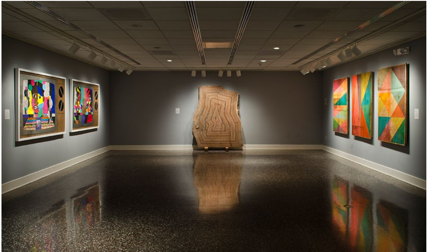
An installation view of "Geometries of Difference: New Approaches to Ornament and Abstraction" at the Samuel Dorsky Museum of Art in New Paltz.