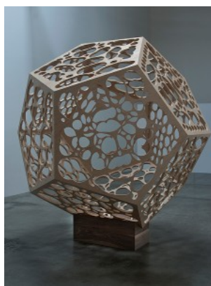
7 Hayv Kahraman, Quasi-Corporeal , 2012.