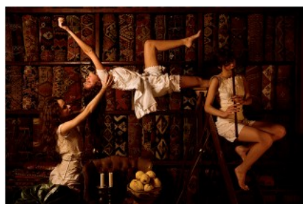
8 Nazif Topcuoglu, Magic Carpets , 2010.