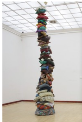
2 Křištof Kintera, Memorial of One Thousand and One Nights II , 2013.