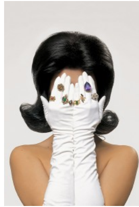
1 Šejla Kamerić, 30 Years After , 2006.

The exhibitors from Dubai, a cross-section from the city's over forty galleries and art centers, navigate the complex context much more discreetly, touching upon socially and culturally sensitive issues nevertheless. The Third Line, for instance, features sculpture and painting by Iraqi-born feminist Hayv Kahraman. Her Quasi-Corporeal (2012) is formally evocative of intricate geometry, yet its seemingly ornamental patterns owe their shapes to the organic—to images of the