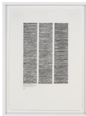
4 Hassan Sharif, Wave-like and Straight Horizontal No. 1–3 , 2007.