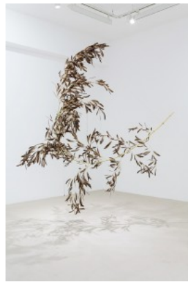
3 Gabriel Orozco, Roiseau 6 , 2012.