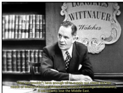
9 Alessandro Balteo Yazbeck (in collaboration with Media Farzin), Chronoscope, 1951, 11pm , 2011.