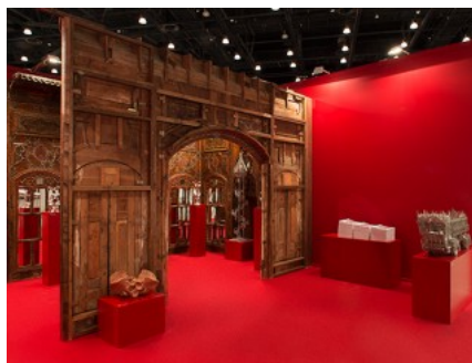
5 Wim Delvoye, Salon d'Aleppo , 2013, installation at Art Dubai 2013.