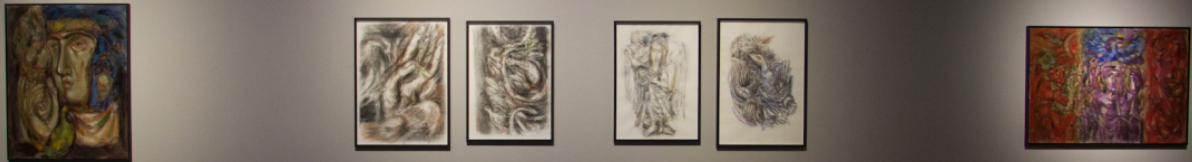
‘After the Deluge’ by Elias Zayat at Green Art Gallery, Sept 14 - Nov 4 2015.

‘Additionally, we opted to move away from traditional brightly lit gallery by dramatically lighting each artwork. The spotlight effect pulls in the viewer, creating an intimate viewing experience with each artwork.’