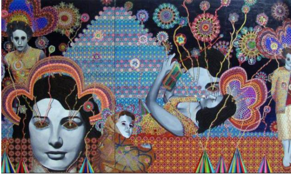
Detail from Asad Faulwell's "Les Femmes d'Alger" series (Asad Faulwell/Lawrie Shabibi)

If you have enough will power to tear yourself away from Dubai's spectacular malls, which are nothing short of monumental odes to consumerism, make a trip to Al Quoz at Alserkal Avenue , the city's premier art district. This industrial area is a veritable culture hub — it is home to 20 art galleries, creative studios, and private museums. On Saturday, January 11, five prominent galleries will open new shows while the others in the area will keep their doors open for you to witness their ongoing shows. The atmosphere is usually electric, and the exquisite art on display will ensure a rewarding experience.